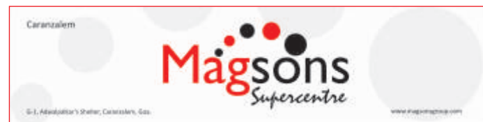
Shop Facade Board

© Copyright 2008. All designs and images shown, remain the intellectual property rights of Exemplar Strategic Solutions unless otherwise agreed in writing with the individual clients represented. No parts may be reproduced in any shape or form without the express written permission of Exemplar