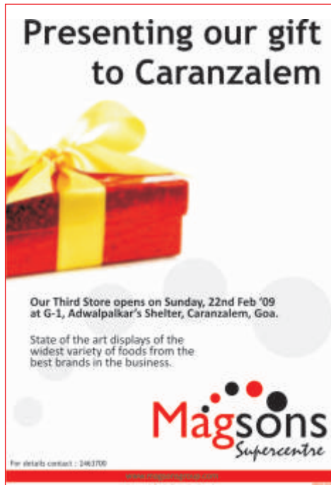
Poster Design for launch