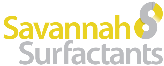
Logo Design for Savannah Surfactants