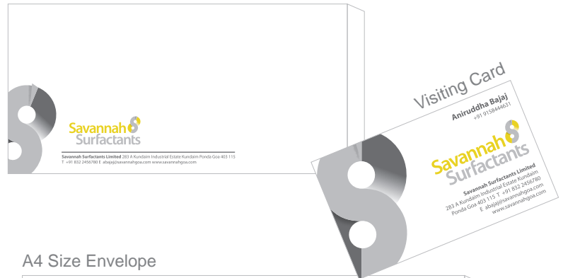
A4 Size Envelope