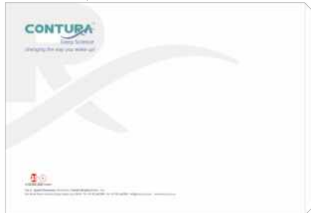
A4 Size Envelope

© Copyright 2008. All designs and images shown, remain the intellectual property rights of Exemplar Strategic Solutions unless otherwise agreed in writing with the individual clients represented. No parts may be reproduced in any shape or form without the express written permission of Exemplar